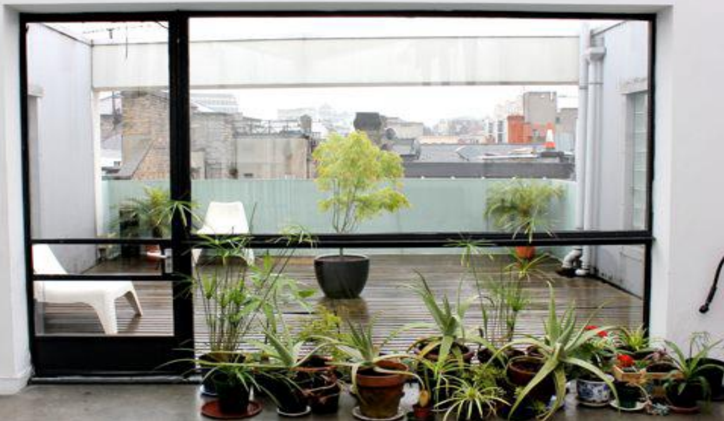
Above: Atrium Space and balcony on the 4 th Floor – four floors available for hire