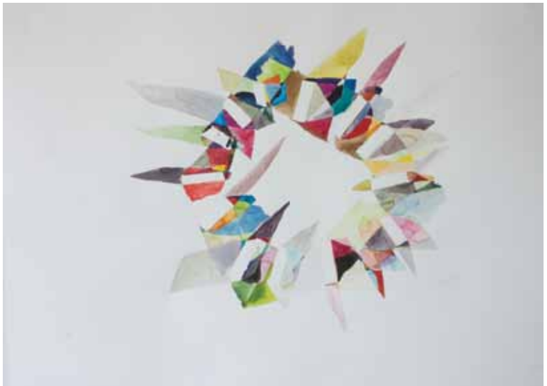
Image: Image One , 2010, 100cm x 70 cm, watercolour on paper, Courtesy the Artist and Green on Red Gallery, Dublin

Exhibitions include All humans do , White Box, New York, 2012, Warp and Woof at the Centre for Contemporary Arts in Glasgow, 2011, <trinity> at Flat Time House, Peckham, London 2011, Nothing is Impossible at The Mattress Factory, Pittsburgh 2010, True Complex at The Void, Derry and The Curated Visual Artist's Award at The Douglas Hyde Gallery, both 2008. She is currently a resident at Rijksakademie van Beeldende Kunsten, Amsterdam. She is included in the collections of the Irish Museum of Modern Art, the Office of Public Works and the Arts Council of Ireland.