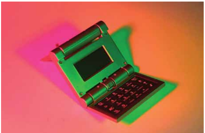
Image: Ed Atkins, 'Death Mask 2: The Scent', 2010, HD Video, 8'19.

For updates see the education section of our website www.templebargallery.com