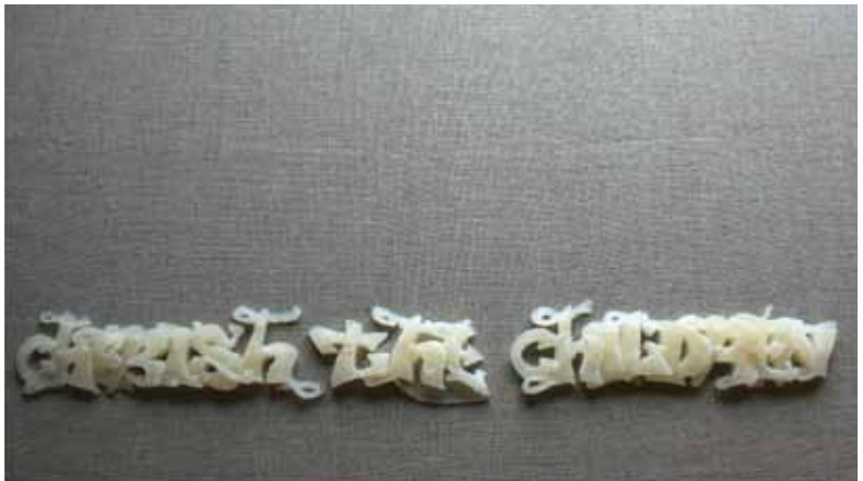
Image: Seamus Nolan, 'Cherish the Children', 2012, courtesy of the artist.

Seamus Nolan is an artist based in Dublin, whose work encompasses installation, public art, and performance. Recent public projects include 'Made in Templebar' Templebar 2011, 'Flight NM7104' in association with Static Liverpool and The NSF Cork 2011, 'The Trades Club Revival' in association with The Model Sligo and CREATE Dublin 2010, 'Docks Tour' National Sculpture Factory Cork and his seminal work 'Hotel Ballymun' commissioned by Breaking Ground, Ballymun Dublin. Solo shows include The Project Arts Centre Dublin, Droichead Arts Centre Co. Louth, The Lab Foley St Dublin and The Wexford Arts Centre. Recent group shows include The Mattress Factory Pittsburgh USA, The East Link Gallery Shanghai China, Static Gallery Liverpool, The Catalyst Arts centre Belfast, with forthcoming shows in The Essl Museum Vienna, Museum der Moderne Salzburg, and Visual Carlow.