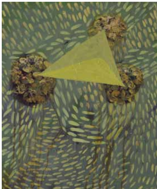
Image: Damien Flood, Envelope , 2011, Oil on Cotton, 50 x 60cm, courtesy the artist and Green on Red Gallery, Dublin.

For updates see the education section of our website www.templebargallery.com